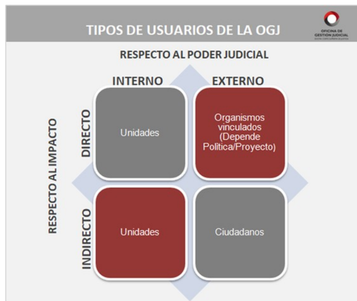
Figure 1. OGJ’s types of users according to impact and closeness.

The actual environment. As part of their modernization journey the OGJ has identified in their environment four main types of users: judiciary units (with direct impact and internal), institution related (with direct impact and external), non-judiciary units (with indirect impact and internal) and the citizens (with indirect impact and external to the institution) (see figure 1).